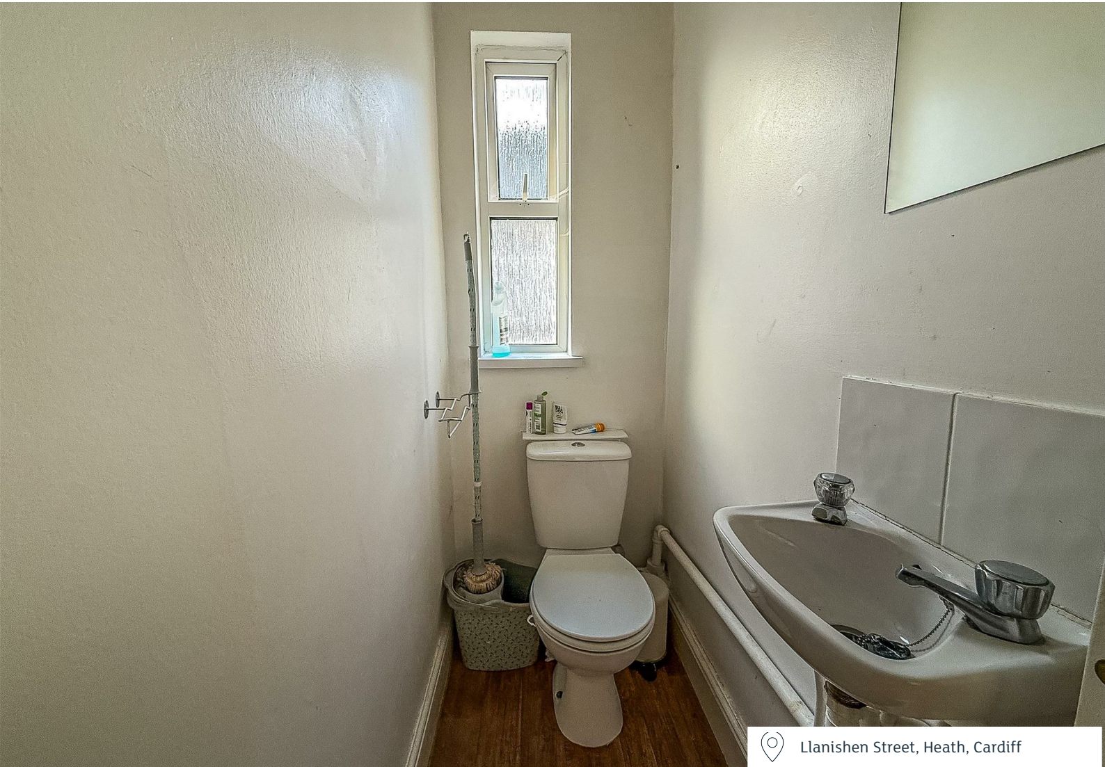
Llanishen Street, Heath, Cardiff